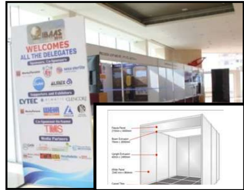
Past Conference Exhibition & Visual Scheme

At the venue of IBAAS conference, exhibition is being organized showcasing the developments of aluminium industry in India and world over. Fully furnished aluminium framed stalls of 2mx2m size would be available for interested companies. More than 200 delegates from India and abroad are expected to participate in this International mega event. The tariff for exhibition stall is as follows: